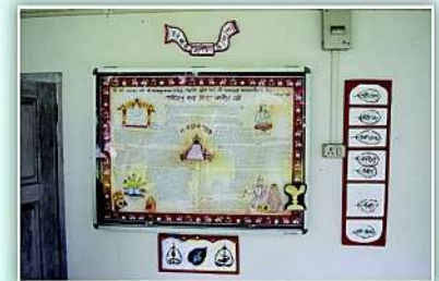
Department of English