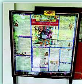
Department of Education