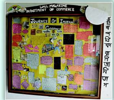
Department of Commerce