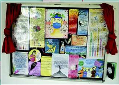
Department of Economics