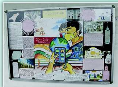
Department of History