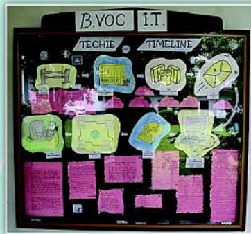
Department of B. Voc