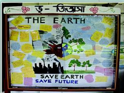
Department of Geography