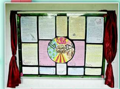
Department of Political Science