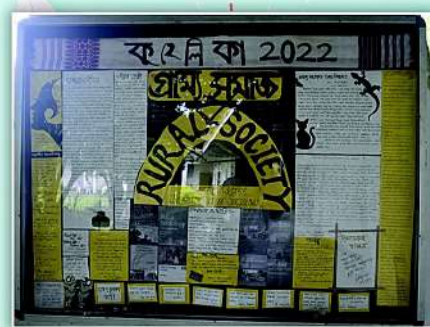
Department of Sociology