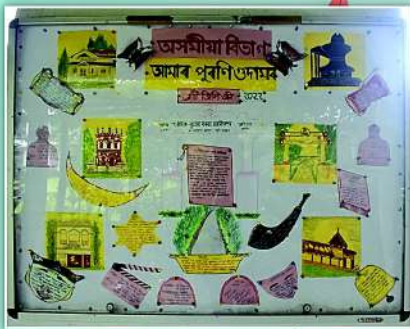
Department of Assamese