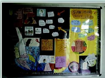
Department of Psychology